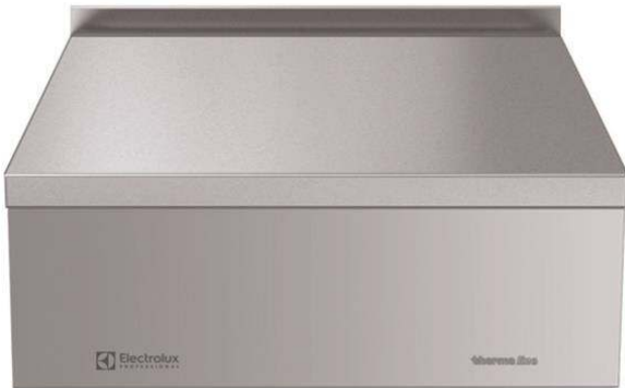
588566 (MBNABBG000) Closed Work Top, one-side operated with backsplash